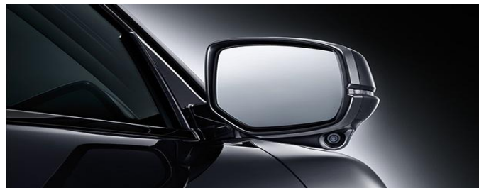
Fig1. Vision cameras for BSDS.

The blind spot detection system(BSDS) is one of the important ADAS systems, which can monitor the blind spot area and gives warning to the driver to avoid the accidents. A BSDS usually use cameras or radar to watch the area around the vehicle and look for vehicles that are nearby. The cameras are always installed on the two side mirrors, as shown on Fig1. In most systems, a light will appear in the side mirror to alert the driver that a vehicle is present. If the driver activates the turn signal while another vehicle is in the blind spot, an audio alert or steering wheel vibration will be activated.