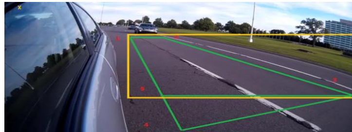
Fig3. ROI region

We can search the vehicle by looking for the edge concentration area. Using priwitt operator to detect edges, the definition of the prewitt operator for f(x,y) is: